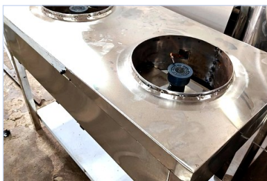
Commercial Chinese Bhatti