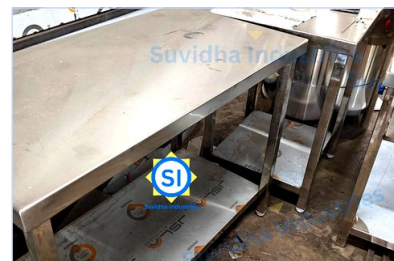
SS Prep / Working Table