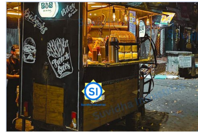
Bites on Break — Client Cart