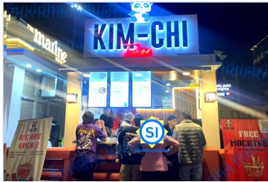
Cheesy Razy Cafe — Client Cart