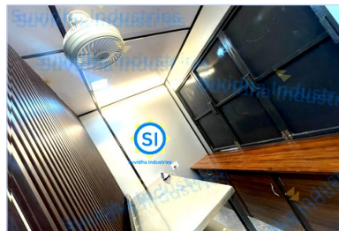
Container Kiosk — Interior