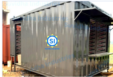
Banarasi Baithak — Client Fit-Out