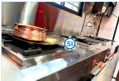
Container Kiosk — Exterior