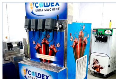
Coldex Soda Machine